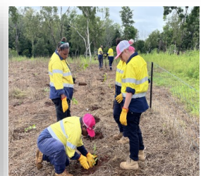
Trainees undertaking ground maintenance on BIITE campus & undertaking other land management activities