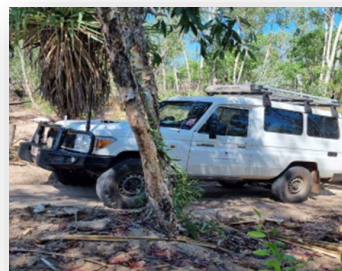
Crew travelling to site