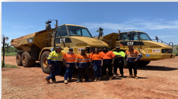
RTL work crew