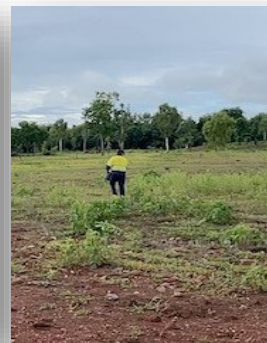
Seed Propagation of Dry Woodland area